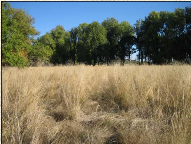
Owens Farm native grass wetland prairie

Our stewardship work at Owens Farm to restore wet prairies and oak woodlands is showing success. This past fall we completed understory removal of an additional block within the oak