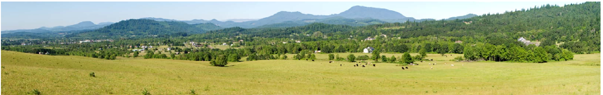
Bald Hill Farm