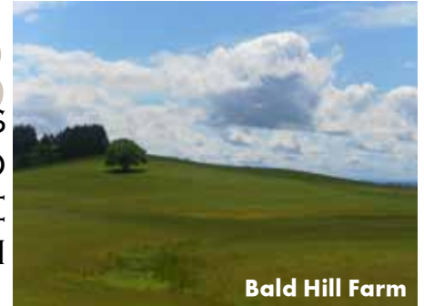
Bald Hill Farm

DONATIONS RECEIVED TO PURCHASE BALD HILL FARM