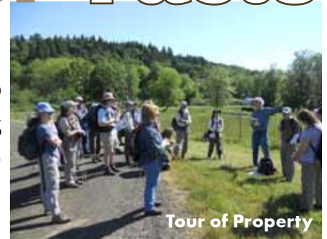
Tour of Property

# OF PEOPLE @ GREENBELT EVENTS (MAY-SEPT)